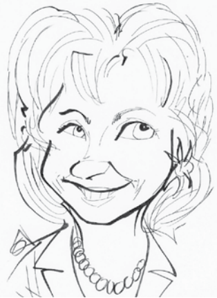
It's Not To Late...Let's Talk